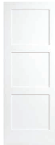
3 Panel Equal Shaker