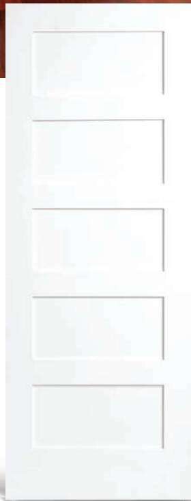
5 Panel Shaker