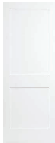
2 Panel Square Top Shaker