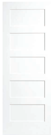
5 Panel Shaker