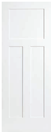
3 Panel Craftsman Shaker