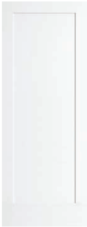
1 Panel Shaker

Note: Check with your customer service rep for lead times.